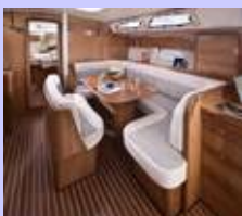
Cruiser 40 Saloon