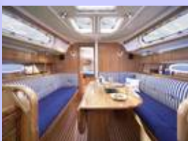
Saloon 38 Cruiser

We would welcome the opportunity to sell your yacht.