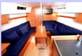
Saloon Cruiser 32

Busfield Marine Brokers 23b Westhaven Drive Westhaven Auckland 1010